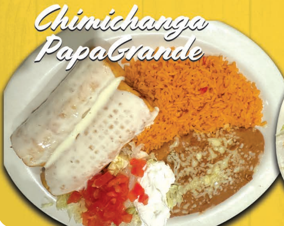
Chimichanga Papa Grande