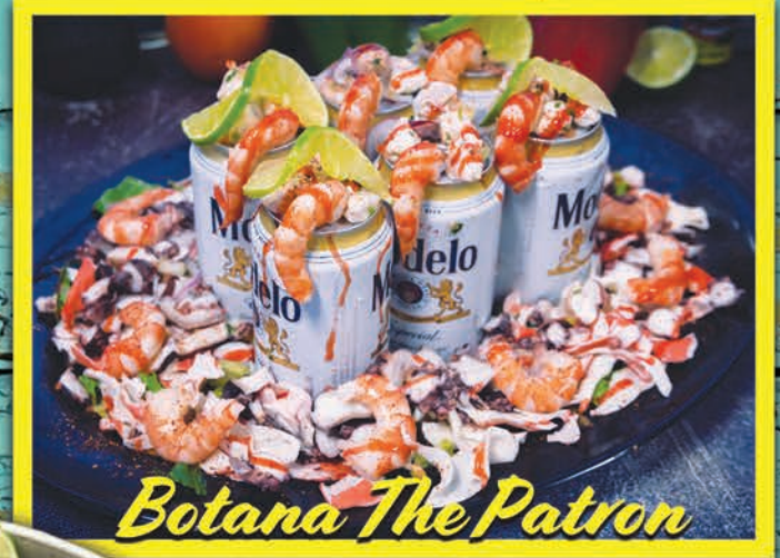
Botana The Patron