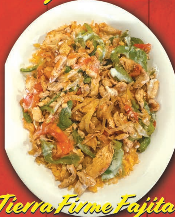
Tierra Firme Fajita