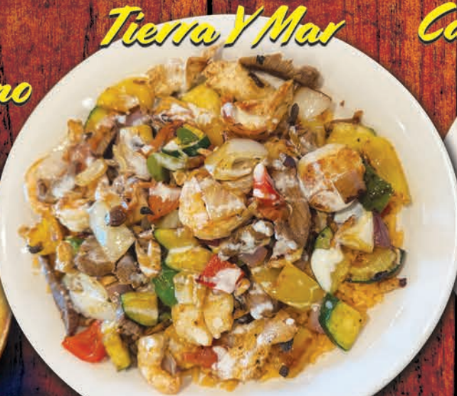
Tierra Y Mar