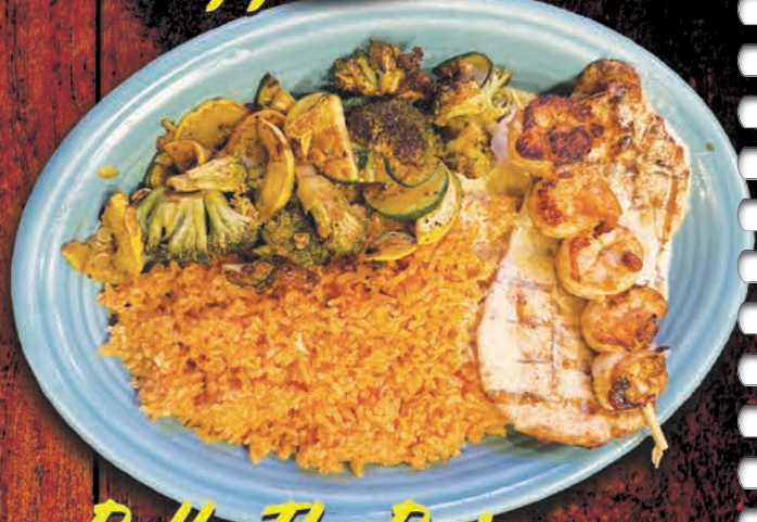
Pollo The Patron