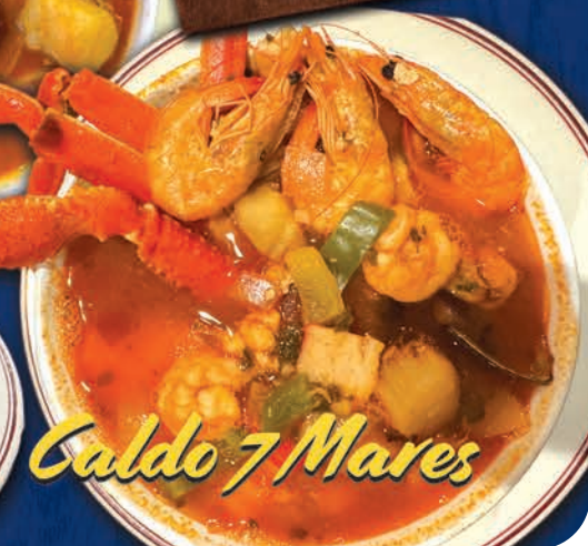
Caldo 7 Mares