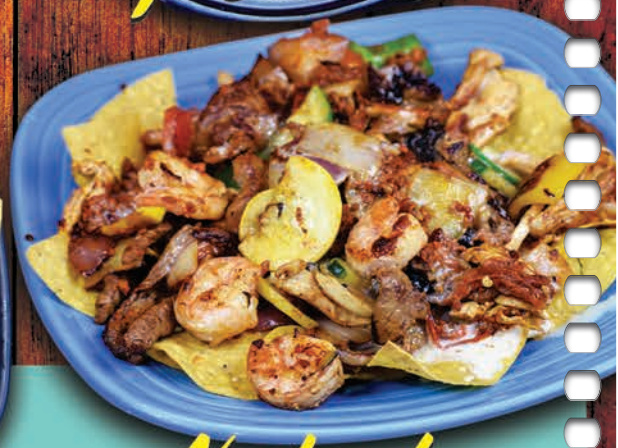
Nachos de La Casa