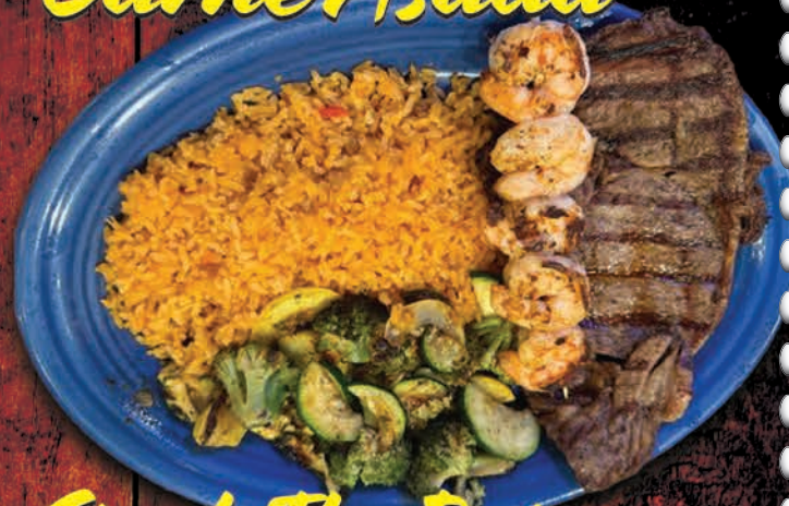
Steak The Patron