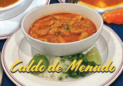
Caldo de Menudo