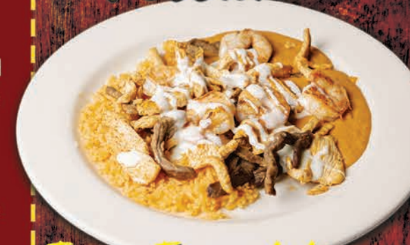
Tierra Firme Jalisco