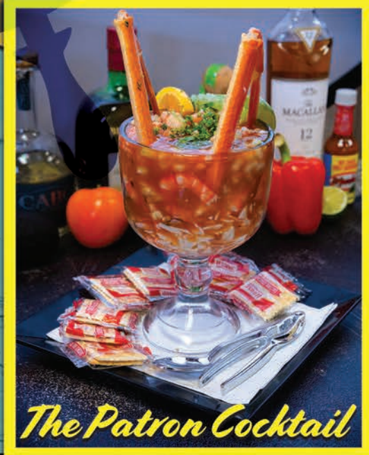
The Patron Cocktail