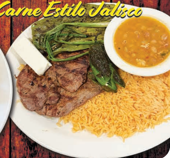
Carne Estilo Jalisco