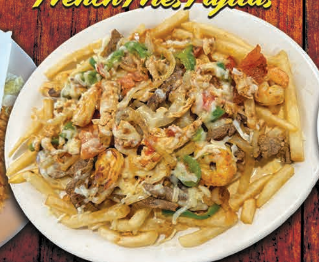
French Fries Fajitas